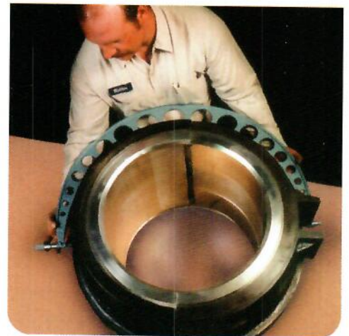
We use only virgin-grade, OEM-spec babbitt materials that conform to SAE or ASTM specifications and test procedures.