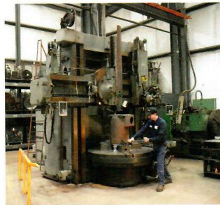
Our repair technicians and machinists emphasize rigid adherence to OEM specifications on all vertical machines.