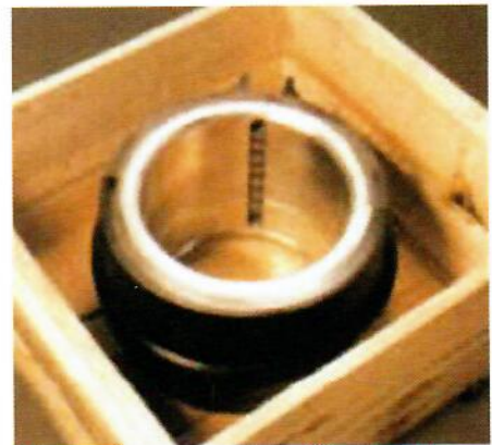
We return bearings in heavy-duty wooden crates to prevent damage in shipping and storage. The Cleveland Rebabbiting Services truck fleet is available 24/7 for pickup and delivery, and we ship all over the world.