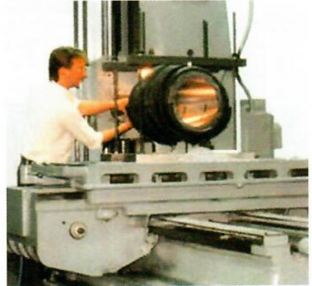
Machining of oil reliefs and grooves ensures optimal bearing lubrication.